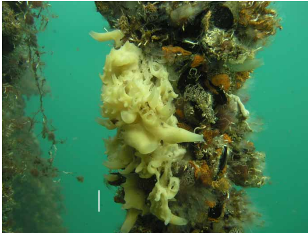
Figure 2. Paraleucilla magna . Scale bar: 5 cm.