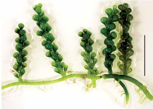
Figure 1. Caulerpa racemosa var. cylindracea . Scale bar: 1 cm.