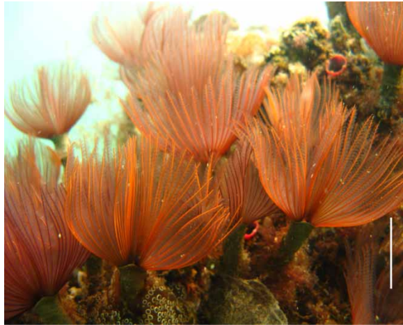
Figure 4. Branchiomma luctuosum . Scale bar: 2 cm.

only once along the South Adriatic coast. Also Novafabricia infratorquata was found only once, with few individuals, between the Adriatic and Ionian Seas (Otranto) [45]. Branchiomma luctuosum (Figure 4) is the only well-established NIS polychaete along the Apulian coast. It occurs along most of the Italian coast and can be considered invasive [46].